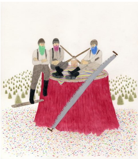
Jay Dart, Geist Tree Loggers , Stump Portrait, 2014, drawing; courtesy of the artist.