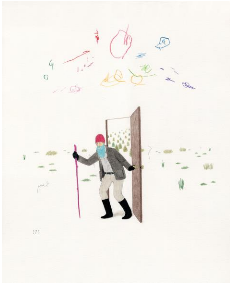
Jay Dart, Now Entering Beyawnder, 2015, drawing; courtesy of the artist.