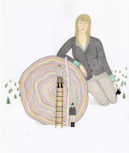
Jay Dart, BeforeYeKnowit , 2015, drawing; courtesy of the artist.

**Please note that all images must be accompanied by complete credits**