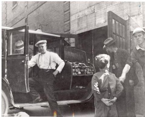
Rum Running During Prohibition

For all press inquiries, please contact: