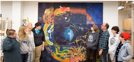
Durham College Thesis Exhibition: 10 Emerging Visions