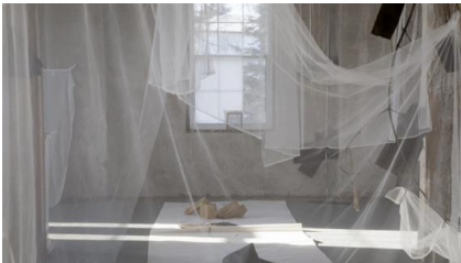
Ruth Read, The Garden in Winter