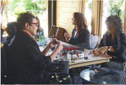
IRIS Group members