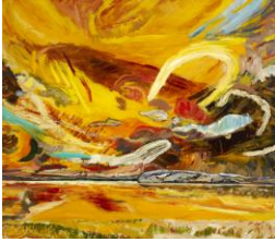
David Alexander (Canadian, b.1947); Ellesmere's Sky Fire and Sky Hooks; 1990; acrylic on canvas; Purchase, 1991

**Please note that all images must be accompanied by complete credits**