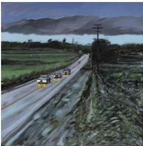
Jim Davies (Canadian, b.1950); The Last to Go (The Ruined Sky); acrylic on canvas; Purchase, 1991