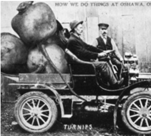
Novelty postcard, "How We Do Things At Oshawa, Ont.," c. 1920s

This exhibition explores the RMG's collection of over 4,500 by investigating the theme of movement, as explored through painting, sculpture, photography, drawing, installation and video. The collection of selected art works examines our ideas of movement through colour, space, landscape, the body and migration.