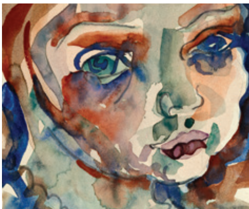
Pegi Nicol MacLeod; Jane ; c.1939; watercolour on paper; Purchase, 1981

The National Film Board of Canada (NFB) has long been acclaimed for documentary, animated and feature films, which are among Canada's iconic cultural products and exports. But few Canadians know that during a pivotal period in the country's history—the mid-twentieth century—the NFB also functioned as the country's official photographer.