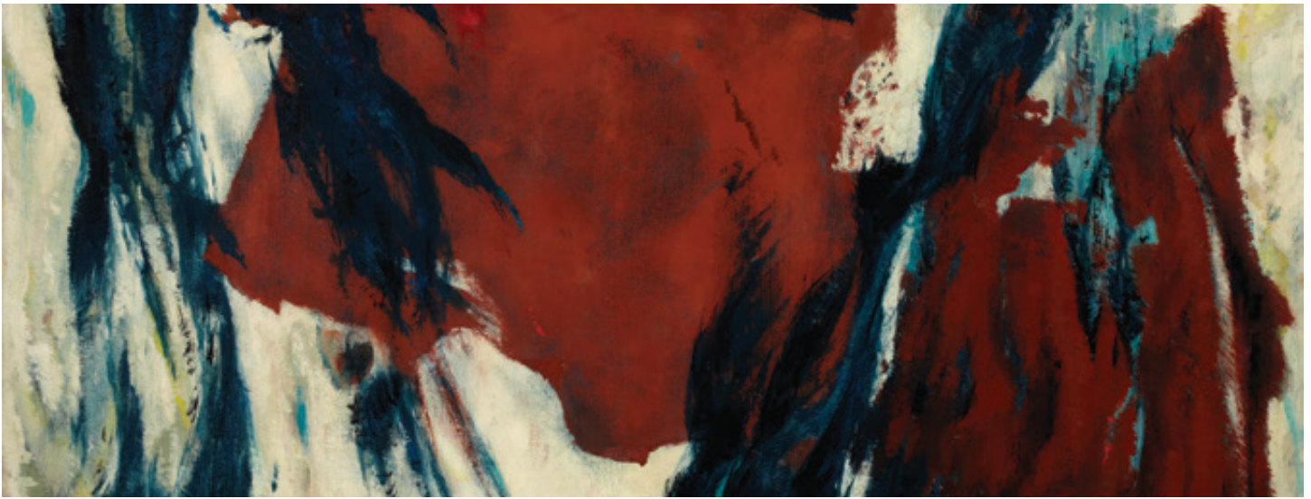
Jock Macdonald, Flood Tide , 1957 (detail), Collection of The Robert McLaughlin Gallery, purchase, 1970