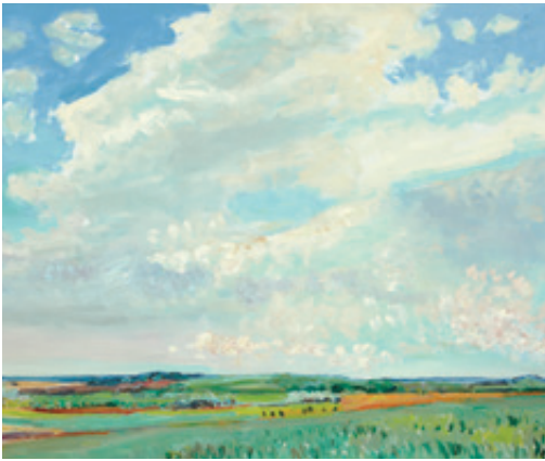
Dorothy Knowles, Moving Clouds OC-004-83 ; 1983; oil on canvas; Gift of the artist, 2012