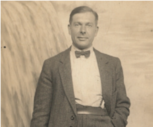
Unidentified portrait from the Thomas Bouckley Collection.

This exhibition explores the RMG's collection of over 4,500 by investigating the theme of movement, as explored through painting, sculpture, photography, drawing, installation and video. The collection of selected art works examines our ideas of movement through colour, space, landscape, the body and migration.