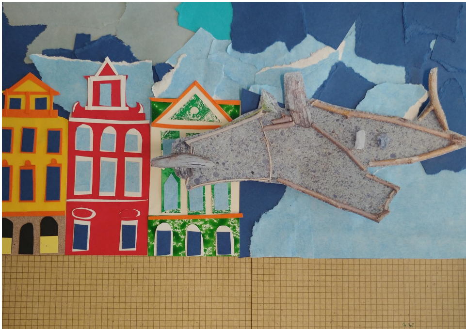
Collaged Go-Cart, Example by the RMG, Mixed Media