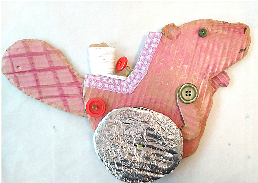
Inspired Go-Cart, Example by the RMG, Mixed Media