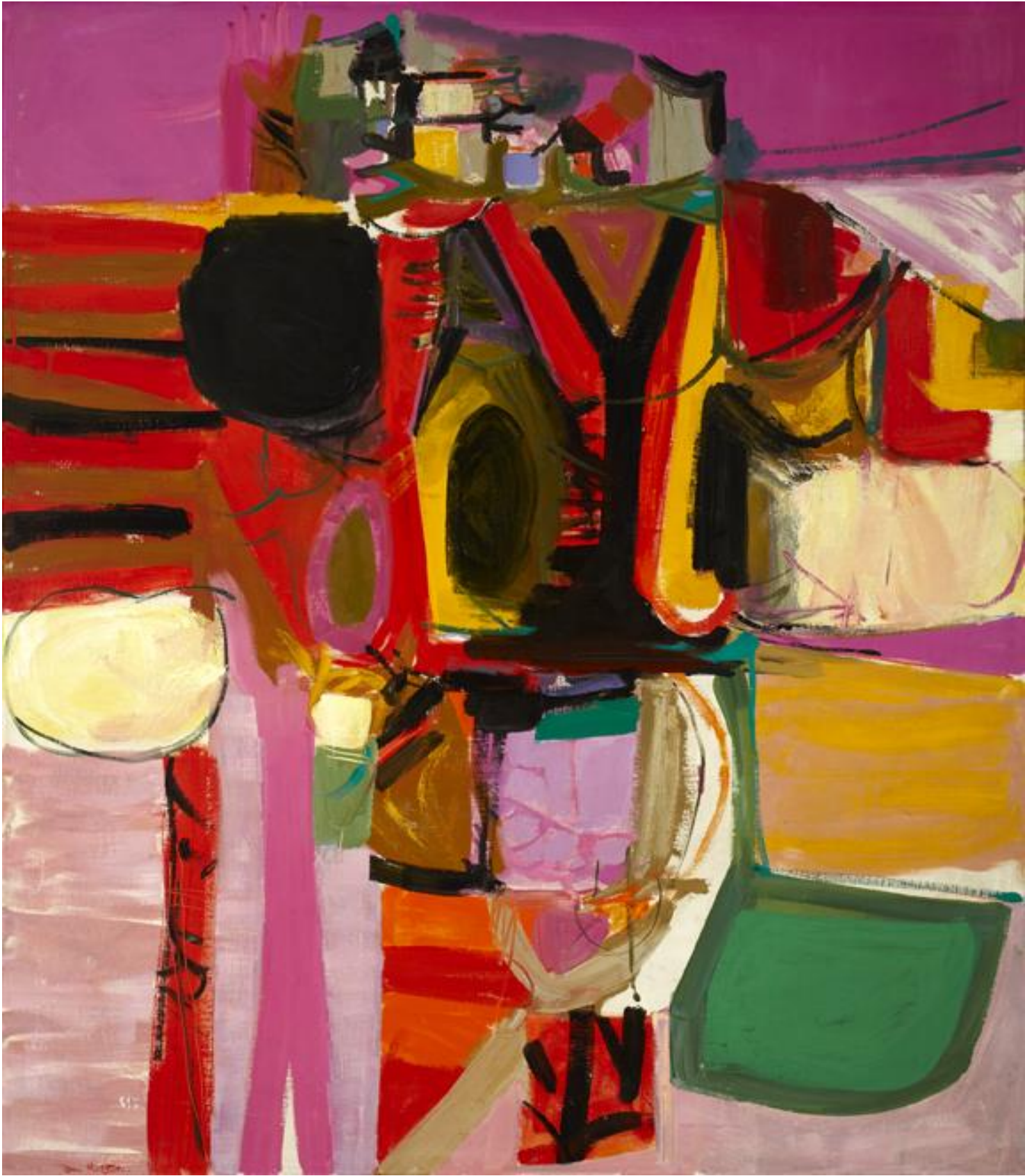
Tom Hodgson, Portrait of a Shirt , 1957, oil on canvas. Purchase 1971.