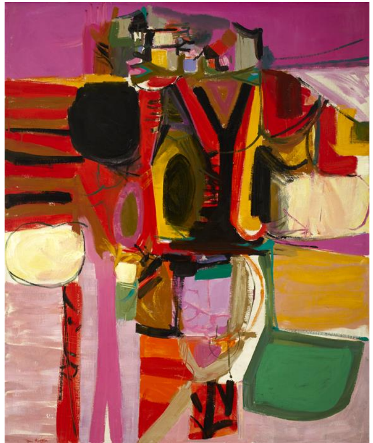
Tom Hodgson, Portrait of a Shirt , 1957, oil on canvas. Purchase 1971.