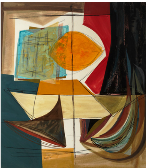
Tom Hodgson, Non-objective Water Colour, 1952, gouache; watercolour; ink; graphite on illustration board. Purchase, 1970

First, choose the image or shapes you want to use for your artwork. Once you've made your choice of shapes, cut them out.