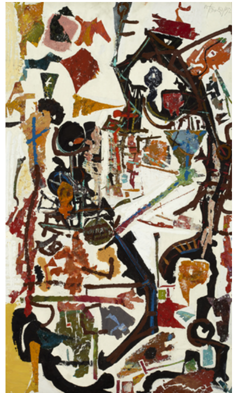
Harold Town, Bagatelle, 1952, oil, sand, lead zinc ground on masonite. Gift of the artist's estate.